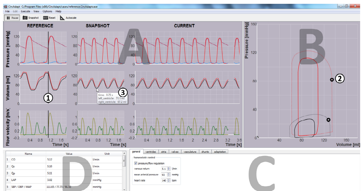
Figure 2: General layout of the CircAdapt Simulator.

One can choose the panes to be displayed by selecting them in the View → Windows menu item. The boundaries between the different panes may be shifted by dragging them with the left mouse button.